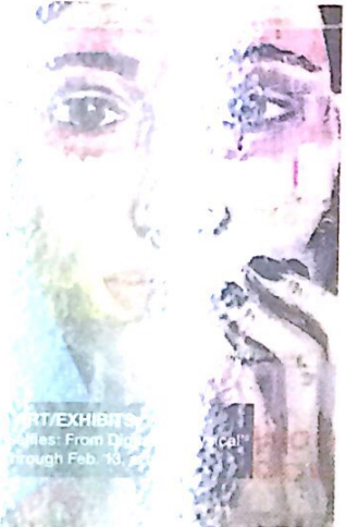
ART/EXHIBITS Selfies: From Digital to Physical through Feb. 13.

SPECIAL EVENTS Nick Cave 'AS IS' March 20, Shreveport Municipal Memorial Auditorium