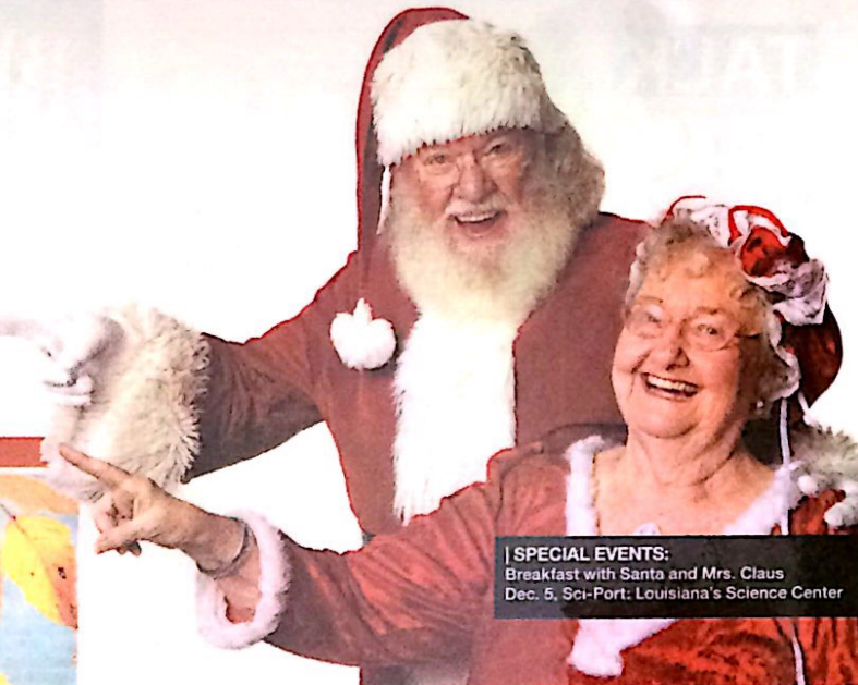
SPECIAL EVENTS: Breakfast with Santa and Mrs. Claus Dec. 5, Sci-Port, Louisiana's Science Center