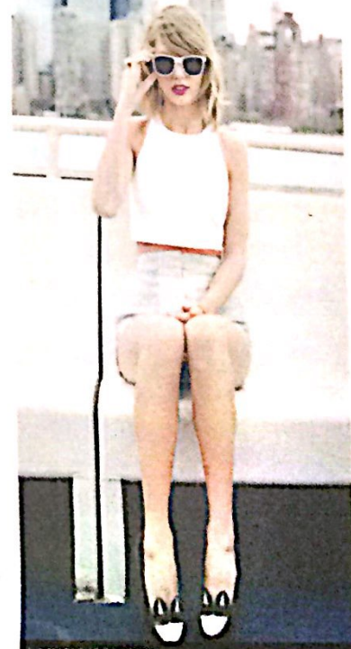
MUSIC/COMEDY: Taylor Swift May 1, CentenaryLink Center

FEB. 20: K. MICHELLE PRESENTS MY TWISTED MIND TOUR, $55 Reserved and $45 general admission. K. Michelle Meet and Greet tickets are $50 (does not include admission). The Strand Theatre, downtown Shreveport. Visit www.thestrandtheatre.com or call 336-8555.