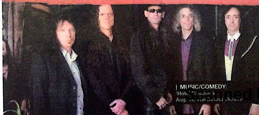
| MUSIC/COMEDY: "Hotel California" Aug. 14, 100 Strand Theater